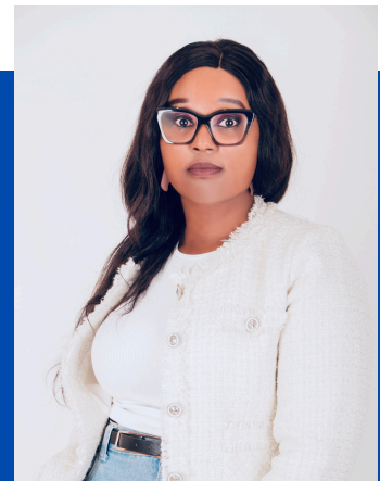
By Kgotatso Malope